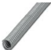
Protective hose, spring steel wire with PVC coating, highly stranded

Protective hose - WP-SPIRAL PVC C 27 - 3240853