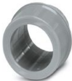
End sleeves as cable protection

Please be informed that the data shown in this PDF Document is generated from our Online Catalog. Please find the complete data in the user's documentation. Our General Terms of Use for Downloads are valid ( http://phoenixcontact.com/download )