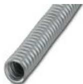
Protective hose, spring steel wire with PVC coating, highly stranded

Protective hose - WP-SPIRAL PVC C 36 - 3240854