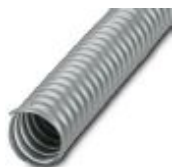
Protective hose, spring steel wire with PVC coating, highly stranded

Protective hose - WP-SPIRAL PVC C 45 - 3240855