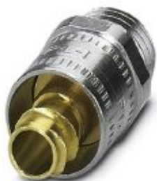
Cable gland made from brass with Pg thread, rotatable, IP40 protection

Please be informed that the data shown in this PDF Document is generated from our Online Catalog. Please find the complete data in the user's documentation. Our General Terms of Use for Downloads are valid ( http://phoenixcontact.com/download )