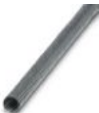
Protective hose in stainless steel

Protective hose - WP-STEEL S 10 - 3240686