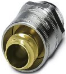
Cable gland made from brass with Pg thread, rotatable, IP40 protection

Please be informed that the data shown in this PDF Document is generated from our Online Catalog. Please find the complete data in the user's documentation. Our General Terms of Use for Downloads are valid ( http://phoenixcontact.com/download )