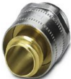
Cable gland made from brass with Pg thread, rotatable, IP40 protection

Please be informed that the data shown in this PDF Document is generated from our Online Catalog. Please find the complete data in the user's documentation. Our General Terms of Use for Downloads are valid ( http://phoenixcontact.com/download )