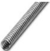
Protective hose in stainless steel

Protective hose - WP-STEEL S 17 - 3240863