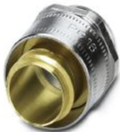
Cable gland made from brass with Pg thread, rotatable, IP40 protection

Please be informed that the data shown in this PDF Document is generated from our Online Catalog. Please find the complete data in the user's documentation. Our General Terms of Use for Downloads are valid ( http://phoenixcontact.com/download )