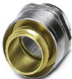
Cable gland made from brass with Pg thread, rotatable, IP40 protection

Please be informed that the data shown in this PDF Document is generated from our Online Catalog. Please find the complete data in the user's documentation. Our General Terms of Use for Downloads are valid ( http://phoenixcontact.com/download )