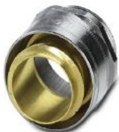
Cable gland made from brass with Pg thread, rotatable, IP40 protection

Please be informed that the data shown in this PDF Document is generated from our Online Catalog. Please find the complete data in the user's documentation. Our General Terms of Use for Downloads are valid ( http://phoenixcontact.com/download )