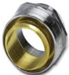
Cable gland made from brass with Pg thread, rotatable, IP40 protection

Please be informed that the data shown in this PDF Document is generated from our Online Catalog. Please find the complete data in the user's documentation. Our General Terms of Use for Downloads are valid ( http://phoenixcontact.com/download )