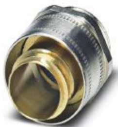
Cable gland made from brass with metric thread, rotatable, IP40 protection

Please be informed that the data shown in this PDF Document is generated from our Online Catalog. Please find the complete data in the user's documentation. Our General Terms of Use for Downloads are valid ( http://phoenixcontact.com/download )