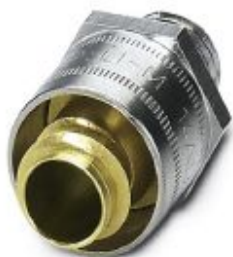
Cable gland made from brass with metric thread, rotatable, IP40 protection

Please be informed that the data shown in this PDF Document is generated from our Online Catalog. Please find the complete data in the user's documentation. Our General Terms of Use for Downloads are valid ( http://phoenixcontact.com/download )