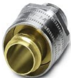
Cable gland made from brass with metric thread, rotatable, IP40 protection

Please be informed that the data shown in this PDF Document is generated from our Online Catalog. Please find the complete data in the user's documentation. Our General Terms of Use for Downloads are valid ( http://phoenixcontact.com/download )