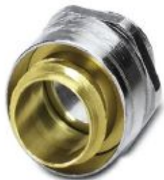
Cable gland made from brass with metric thread, rotatable, IP40 protection

Please be informed that the data shown in this PDF Document is generated from our Online Catalog. Please find the complete data in the user's documentation. Our General Terms of Use for Downloads are valid ( http://phoenixcontact.com/download )