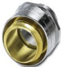
Cable gland made from brass with metric thread, rotatable, IP40 protection

Please be informed that the data shown in this PDF Document is generated from our Online Catalog. Please find the complete data in the user's documentation. Our General Terms of Use for Downloads are valid ( http://phoenixcontact.com/download )