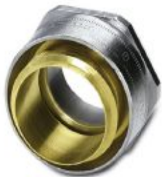
Cable gland made from brass with metric thread, rotatable, IP40 protection

Please be informed that the data shown in this PDF Document is generated from our Online Catalog. Please find the complete data in the user's documentation. Our General Terms of Use for Downloads are valid ( http://phoenixcontact.com/download )