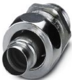
Cable gland made from brass with Pg thread, IP40 protection

Please be informed that the data shown in this PDF Document is generated from our Online Catalog. Please find the complete data in the user's documentation. Our General Terms of Use for Downloads are valid ( http://phoenixcontact.com/download )