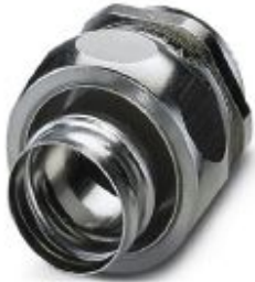
Cable gland made from brass with Pg thread, IP40 protection

Please be informed that the data shown in this PDF Document is generated from our Online Catalog. Please find the complete data in the user's documentation. Our General Terms of Use for Downloads are valid ( http://phoenixcontact.com/download )