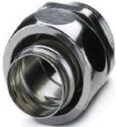
Cable gland made from brass with Pg thread, IP40 protection

Please be informed that the data shown in this PDF Document is generated from our Online Catalog. Please find the complete data in the user's documentation. Our General Terms of Use for Downloads are valid ( http://phoenixcontact.com/download )