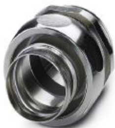
Cable gland made from brass with Pg thread, IP40 protection

Please be informed that the data shown in this PDF Document is generated from our Online Catalog. Please find the complete data in the user's documentation. Our General Terms of Use for Downloads are valid ( http://phoenixcontact.com/download )