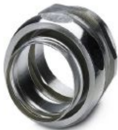
Cable gland made from brass with Pg thread, IP40 protection

Please be informed that the data shown in this PDF Document is generated from our Online Catalog. Please find the complete data in the user's documentation. Our General Terms of Use for Downloads are valid ( http://phoenixcontact.com/download )