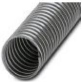
Protective hose in galvanized steel

Protective hose - WP-STEEL ZC 45 - 3240701