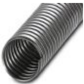
Protective hose in stainless steel

Protective hose - WP-STEEL S 45 - 3240690