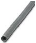
Protective hose in galvanized steel

Protective hose - WP-STEEL ZC 10 - 3240697