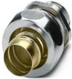
Cable gland made from brass with metric thread, IP40 protection

Please be informed that the data shown in this PDF Document is generated from our Online Catalog. Please find the complete data in the user's documentation. Our General Terms of Use for Downloads are valid ( http://phoenixcontact.com/download )