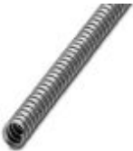
Protective hose in galvanized steel

Protective hose - WP-STEEL ZC 14 - 3240865