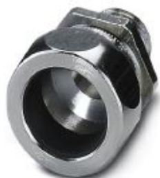
Cable gland made from brass with metric thread, IP40 protection

Please be informed that the data shown in this PDF Document is generated from our Online Catalog. Please find the complete data in the user's documentation. Our General Terms of Use for Downloads are valid ( http://phoenixcontact.com/download )