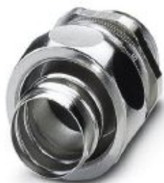
Cable gland made from brass with metric thread, IP40 protection

Please be informed that the data shown in this PDF Document is generated from our Online Catalog. Please find the complete data in the user's documentation. Our General Terms of Use for Downloads are valid ( http://phoenixcontact.com/download )