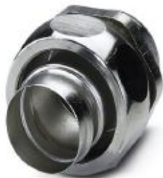
Cable gland made from brass with metric thread, IP40 protection

Please be informed that the data shown in this PDF Document is generated from our Online Catalog. Please find the complete data in the user's documentation. Our General Terms of Use for Downloads are valid ( http://phoenixcontact.com/download )