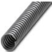
Protective hose in stainless steel

Protective hose - WP-STEEL S 27 - 3240864