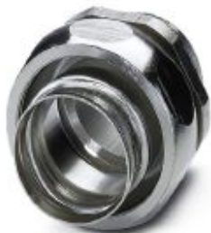
Cable gland made from brass with metric thread, IP40 protection

Please be informed that the data shown in this PDF Document is generated from our Online Catalog. Please find the complete data in the user's documentation. Our General Terms of Use for Downloads are valid ( http://phoenixcontact.com/download )