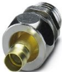
Cable gland made from brass with Pg thread, IP65 protection

Please be informed that the data shown in this PDF Document is generated from our Online Catalog. Please find the complete data in the user's documentation. Our General Terms of Use for Downloads are valid ( http://phoenixcontact.com/download )