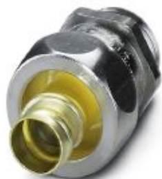
Cable gland made from brass with Pg thread, IP65 protection

Please be informed that the data shown in this PDF Document is generated from our Online Catalog. Please find the complete data in the user's documentation. Our General Terms of Use for Downloads are valid ( http://phoenixcontact.com/download )