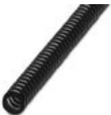
Galvanized steel protective hose with PVC coating

Protective hose - WP-STEEL PVC C 17 - 3240869