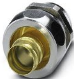
Cable gland made from brass with Pg thread, IP65 protection

Please be informed that the data shown in this PDF Document is generated from our Online Catalog. Please find the complete data in the user's documentation. Our General Terms of Use for Downloads are valid ( http://phoenixcontact.com/download )