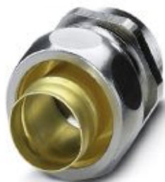
Cable gland made from brass with Pg thread, IP65 protection

Please be informed that the data shown in this PDF Document is generated from our Online Catalog. Please find the complete data in the user's documentation. Our General Terms of Use for Downloads are valid ( http://phoenixcontact.com/download )