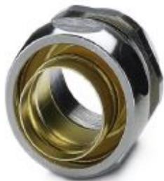
Cable gland made from brass with Pg thread, IP65 protection

Please be informed that the data shown in this PDF Document is generated from our Online Catalog. Please find the complete data in the user's documentation. Our General Terms of Use for Downloads are valid ( http://phoenixcontact.com/download )