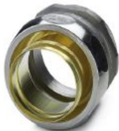
Cable gland made from brass with Pg thread, IP65 protection

Please be informed that the data shown in this PDF Document is generated from our Online Catalog. Please find the complete data in the user's documentation. Our General Terms of Use for Downloads are valid ( http://phoenixcontact.com/download )