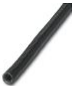
Galvanized steel protective hose with PVC coating

Protective hose - WP-STEEL PVC C 10 - 3240867