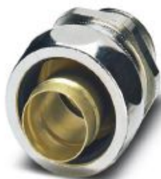
Cable gland made from brass with metric thread, IP65 protection

Please be informed that the data shown in this PDF Document is generated from our Online Catalog. Please find the complete data in the user's documentation. Our General Terms of Use for Downloads are valid ( http://phoenixcontact.com/download )