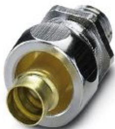
Cable gland made from brass with metric thread, IP65 protection

Please be informed that the data shown in this PDF Document is generated from our Online Catalog. Please find the complete data in the user's documentation. Our General Terms of Use for Downloads are valid ( http://phoenixcontact.com/download )