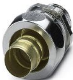
Cable gland made from brass with metric thread, IP65 protection

Please be informed that the data shown in this PDF Document is generated from our Online Catalog. Please find the complete data in the user's documentation. Our General Terms of Use for Downloads are valid ( http://phoenixcontact.com/download )