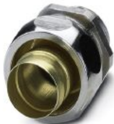
Cable gland made from brass with metric thread, IP65 protection

Please be informed that the data shown in this PDF Document is generated from our Online Catalog. Please find the complete data in the user's documentation. Our General Terms of Use for Downloads are valid ( http://phoenixcontact.com/download )