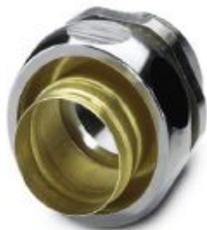
Cable gland made from brass with metric thread, IP65 protection

Please be informed that the data shown in this PDF Document is generated from our Online Catalog. Please find the complete data in the user's documentation. Our General Terms of Use for Downloads are valid ( http://phoenixcontact.com/download )