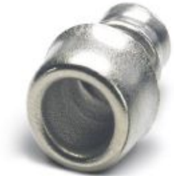
End sleeves as cable protection, made of brass

Please be informed that the data shown in this PDF Document is generated from our Online Catalog. Please find the complete data in the user's documentation. Our General Terms of Use for Downloads are valid ( http://phoenixcontact.com/download )