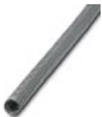
Protective hose in galvanized steel

Protective hose - WP-STEEL ZC 10 - 3240697