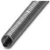
Protective hose in stainless steel

Protective hose - WP-STEEL S 21 - 3240688