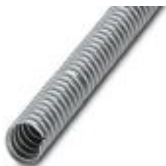
Protective hose in galvanized steel

Protective hose - WP-STEEL ZC 21 - 3240699