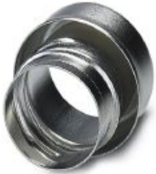
End sleeves as cable protection, made of brass

Please be informed that the data shown in this PDF Document is generated from our Online Catalog. Please find the complete data in the user's documentation. Our General Terms of Use for Downloads are valid ( http://phoenixcontact.com/download )