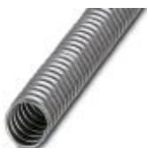
Protective hose in galvanized steel

Protective hose - WP-STEEL ZC 27 - 3240866