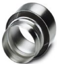
End sleeves as cable protection, made of brass

Please be informed that the data shown in this PDF Document is generated from our Online Catalog. Please find the complete data in the user's documentation. Our General Terms of Use for Downloads are valid ( http://phoenixcontact.com/download )