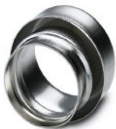
End sleeves as cable protection, made of brass

Please be informed that the data shown in this PDF Document is generated from our Online Catalog. Please find the complete data in the user's documentation. Our General Terms of Use for Downloads are valid ( http://phoenixcontact.com/download )