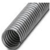
Protective hose in galvanized steel

Protective hose - WP-STEEL ZC 36 - 3240700