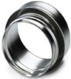
End sleeves as cable protection, made of brass

Please be informed that the data shown in this PDF Document is generated from our Online Catalog. Please find the complete data in the user's documentation. Our General Terms of Use for Downloads are valid ( http://phoenixcontact.com/download )