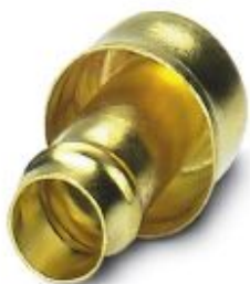
End sleeves as cable protection, made of brass, for WP-STEEL PVC C

Please be informed that the data shown in this PDF Document is generated from our Online Catalog. Please find the complete data in the user's documentation. Our General Terms of Use for Downloads are valid ( http://phoenixcontact.com/download )