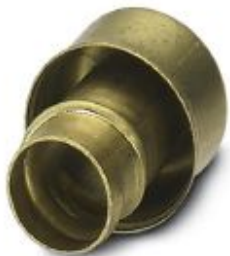
End sleeves as cable protection, made of brass, for WP-STEEL PVC C

Please be informed that the data shown in this PDF Document is generated from our Online Catalog. Please find the complete data in the user's documentation. Our General Terms of Use for Downloads are valid ( http://phoenixcontact.com/download )