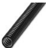
Galvanized steel protective hose with PVC coating

Protective hose - WP-STEEL PVC C 21 - 3240870