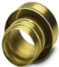
End sleeves as cable protection, made of brass, for WP-STEEL PVC C

Please be informed that the data shown in this PDF Document is generated from our Online Catalog. Please find the complete data in the user's documentation. Our General Terms of Use for Downloads are valid ( http://phoenixcontact.com/download )