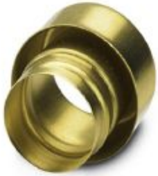
End sleeves as cable protection, made of brass, for WP-STEEL PVC C

Please be informed that the data shown in this PDF Document is generated from our Online Catalog. Please find the complete data in the user's documentation. Our General Terms of Use for Downloads are valid ( http://phoenixcontact.com/download )