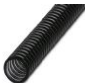
Galvanized steel protective hose with PVC coating

Protective hose - WP-STEEL PVC C 27 - 3240871