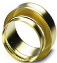
End sleeves as cable protection, made of brass, for WP-STEEL PVC C

Please be informed that the data shown in this PDF Document is generated from our Online Catalog. Please find the complete data in the user's documentation. Our General Terms of Use for Downloads are valid ( http://phoenixcontact.com/download )