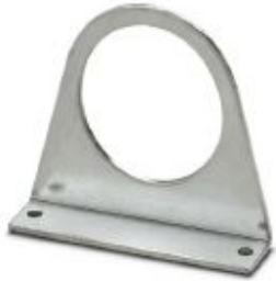
Fixing bracket for protective sleeves, fixed with two screws

Please be informed that the data shown in this PDF Document is generated from our Online Catalog. Please find the complete data in the user's documentation. Our General Terms of Use for Downloads are valid ( http://phoenixcontact.com/download )