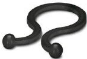
The figure shows a version of the product

Cable drillers, for fast and tool-free bundling of conductors and cables, removable and reusable