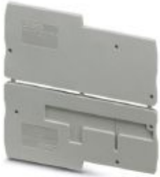
End cover, length: 74.4 mm, width: 2.2 mm, height: 33.8 mm, color: gray

Please be informed that the data shown in this PDF Document is generated from our Online Catalog. Please find the complete data in the user's documentation. Our General Terms of Use for Downloads are valid ( http://phoenixcontact.com/download )